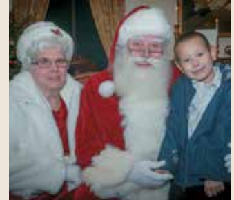
Holiday Open House