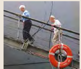
Baltimore Trip, May 15