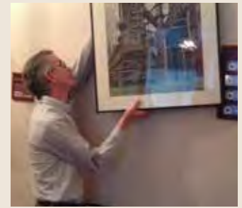
Volunteer Day, April 12