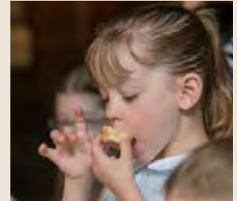
Victorian Tea, May 10